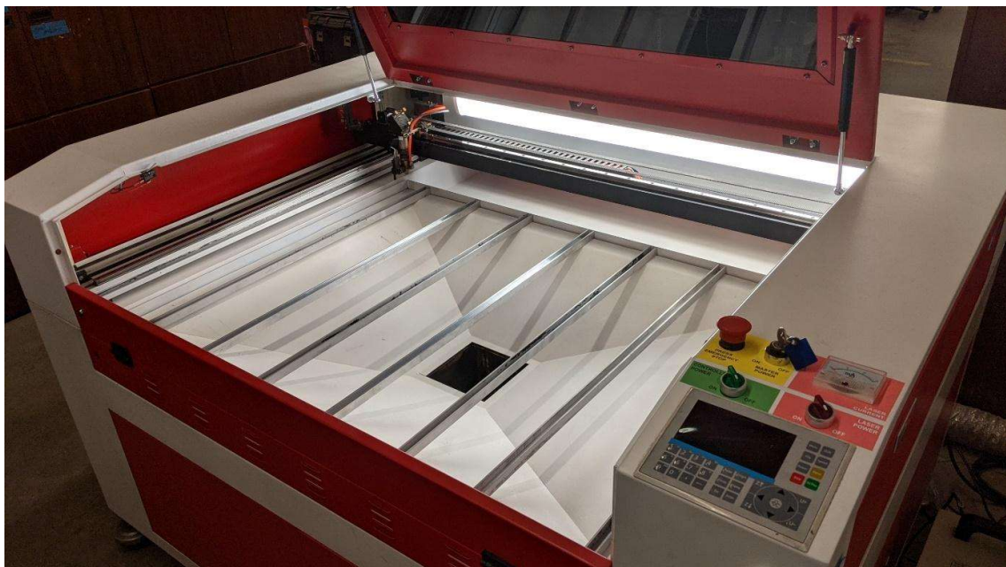
Day 56 – Laser completely scrubbed, rebuilt, and painted.

The laser required a new linear rail and guide blocks, cable chain, switches, belts, windows, gas springs, air tubing, power wires, lights, support rails, panel latches, exhaust ducting, lots of paint and a little metal bending to straighten heat